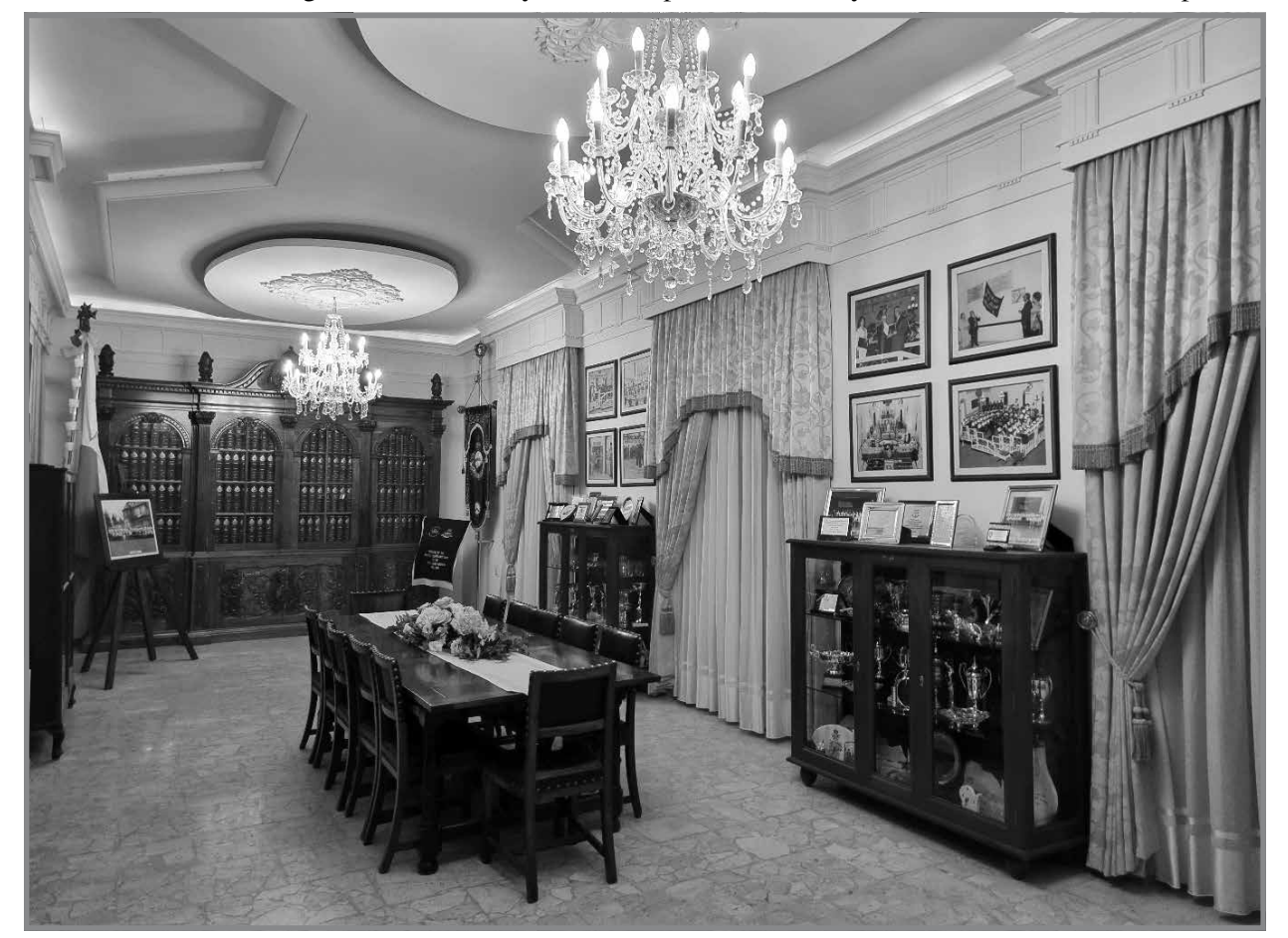
The Imperial Band Club Committee Room

Band clubs are run by a committee elected by members, and elected committee members serve on a voluntary basis for a term of one or two years, depending on the club's statute. The committee is responsible for the day-to-day running of the club with the main positions being those of President, General Secretary, Treasurer, Club Director and Band Delegate. There is usually an assistant to each post and in many instances, there is also a Spiritual