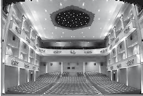
Astra Theatre, Gozo