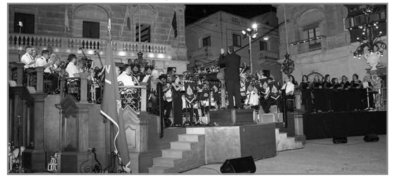
The Imperial Band and Choir during the Festa Annual Concert

Musicians - just like club members - come from