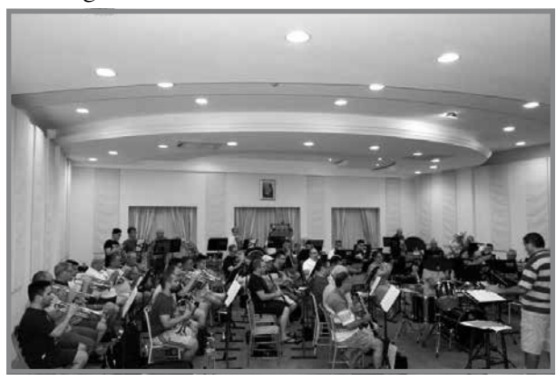
The Imperial Band Club Music Room

Other facilities within the club include a hall (used for social, cultural and fundraising events), teaching rooms and the music room.