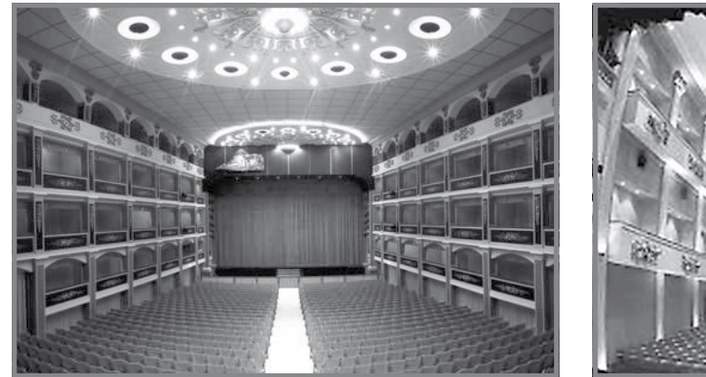
Aurora Theatre, Gozo

"Il-bottegin" (the Maltese word for bar) is the first place you see when entering a club. The bar is the most frequented part of the club and it is a