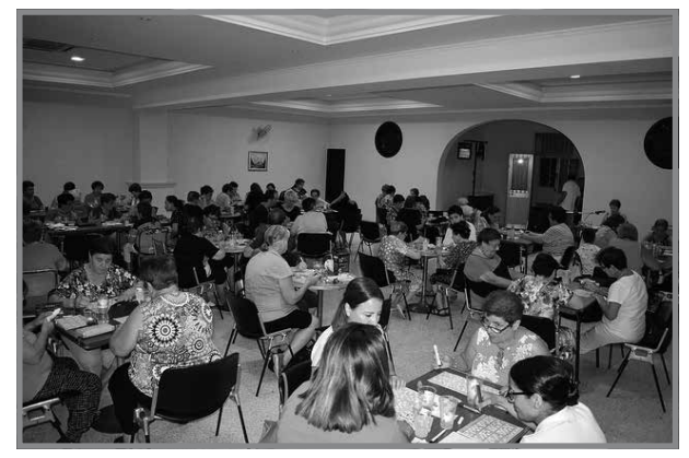
A fundraising activity at the Imperial Band Club

Within a band club structure, there are also sub-committees. The Youth Section (Kummissjoni Żgħażagħ) is responsible for organising innovative activities which encourage new young people to join the club whilst the Band Sub-Committee (Kummissjoni Banda) looks after everything which is needed in order to ensure the smooth running of all musical activities within the band club. Traditionally, some clubs would also have what was known as a 'Ladies Circle' (Kummissjoni Nisa) where women would come together to organise fundraising activities for the club. Whilst these subcommittees do still exist in some band clubs in Malta, there is an increasing trend for responsibilities that were traditionally seen as being the role of women, to be integrated into the main committee and other sub-committees.